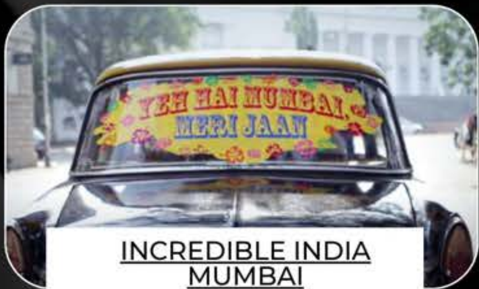
INCREDIBLE INDIA MUMBAI