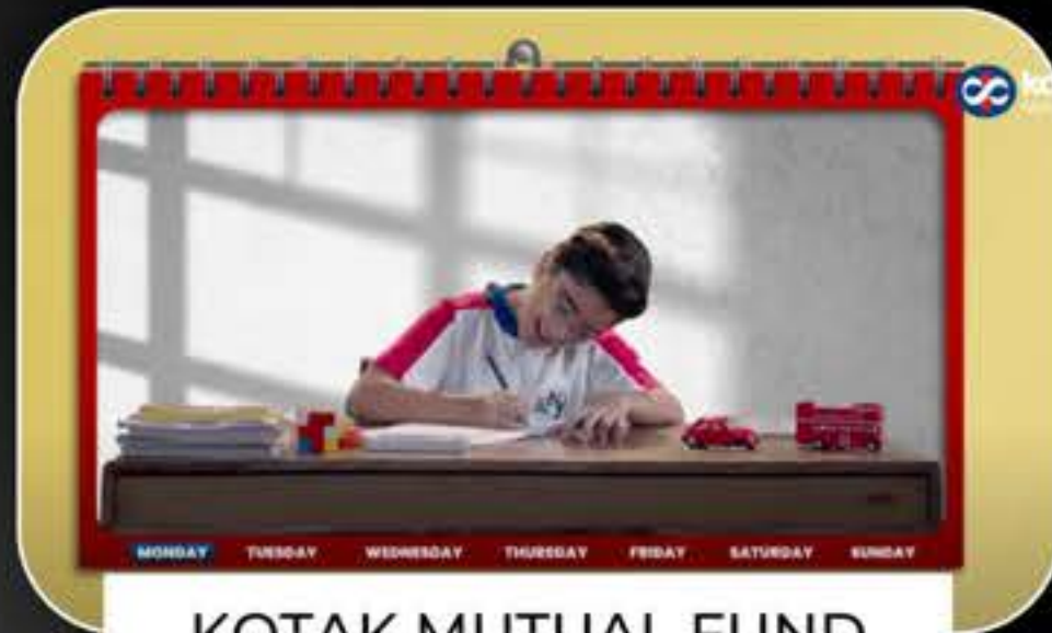
KOTAK MUTUAL FUND