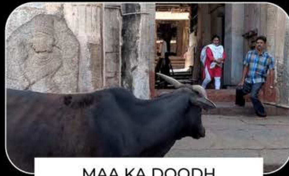
MAA KA DOODH