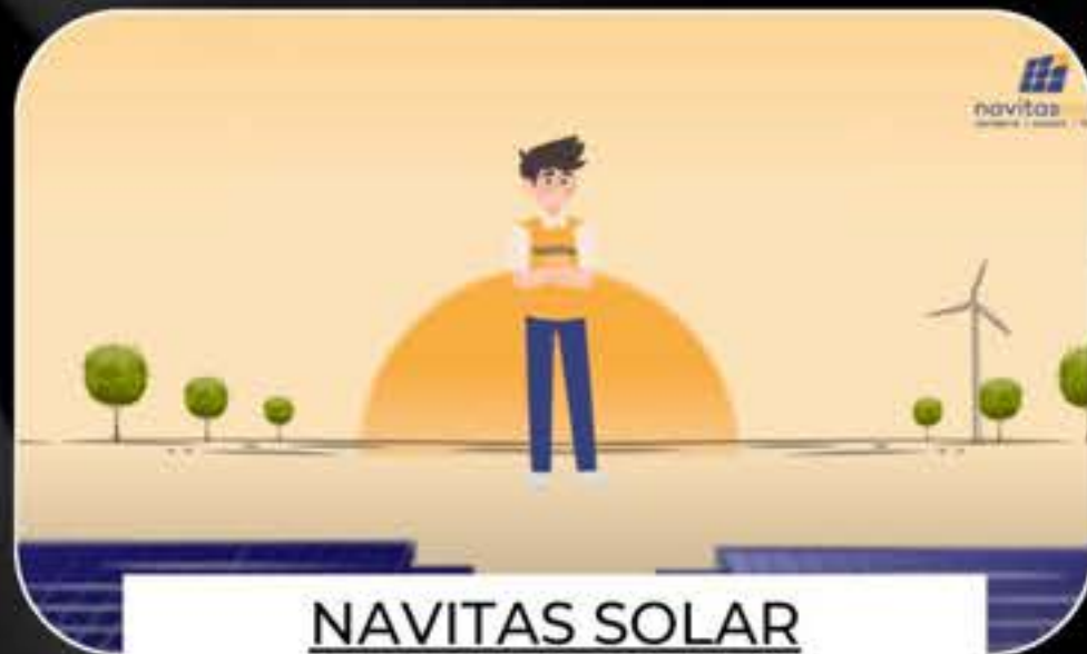
NAVITAS SOLAR (ANIMATION SERIES)