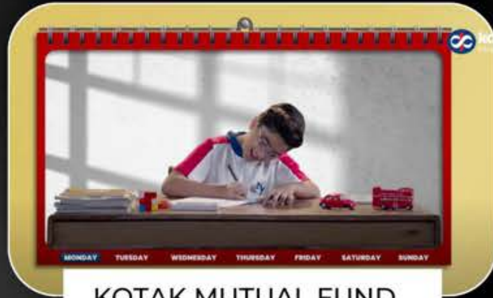
KOTAK MUTUAL FUND