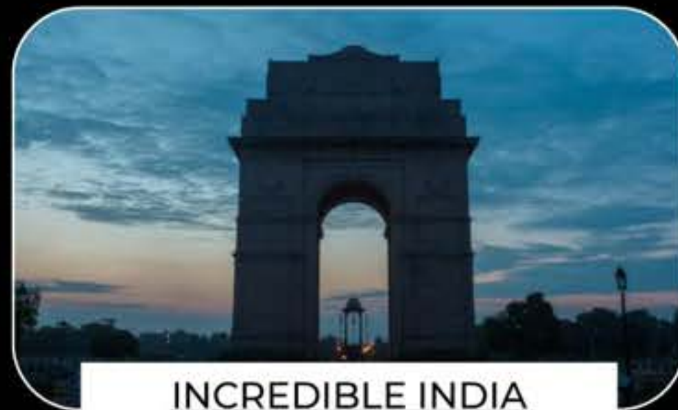
INCREDIBLE INDIA DELHI