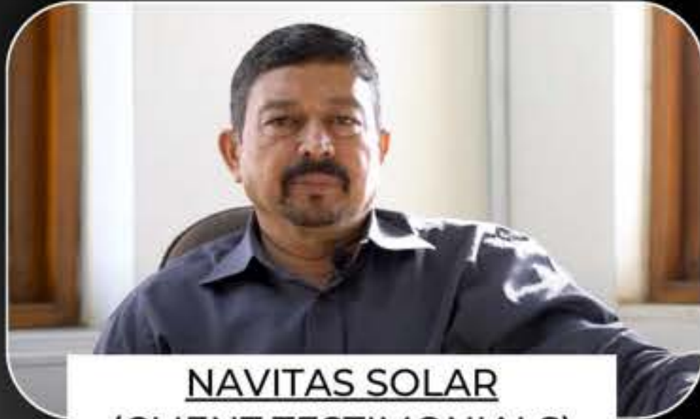
NAVITAS SOLAR (CLIENT TESTIMONIALS)