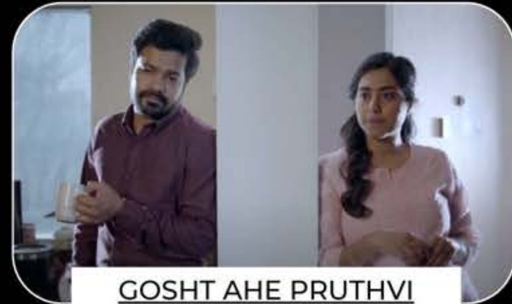
GOSHT AHE PRUTHVI MOLACHI