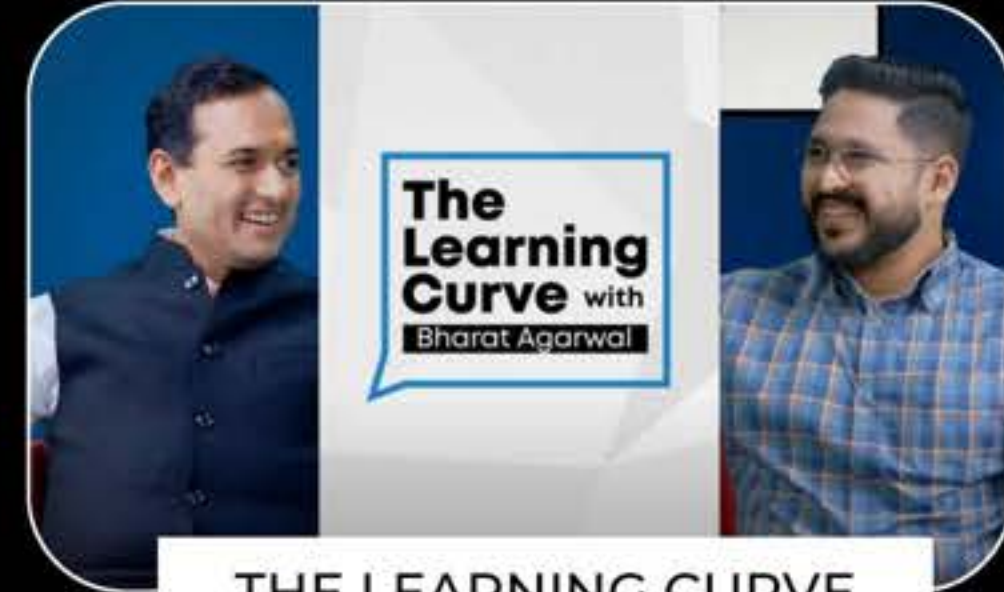
THE LEARNING CURVE