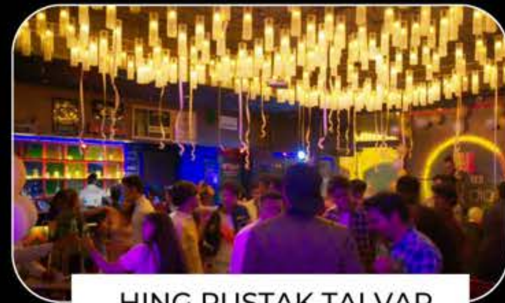
HING PUSTAK TALVAR