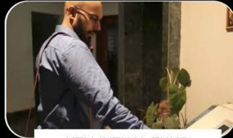
UTI MUTUAL FUND